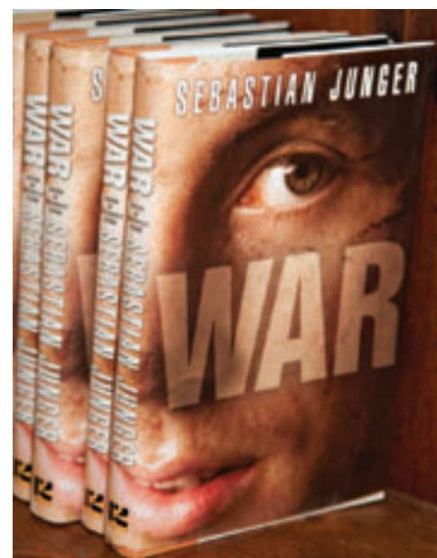
The author chronicled 15 hellish months stationed in the Korengal Valley in Afghanistan in War .

“I happened to be down here for Hurricane Bob, (in 1991) and I was doing tree work. It just cut the Achilles, it tore it up,” says Junger lifting his left pant leg, displaying the scar on his calf from the accident. “I was injured, so I was already thinking about risk.”