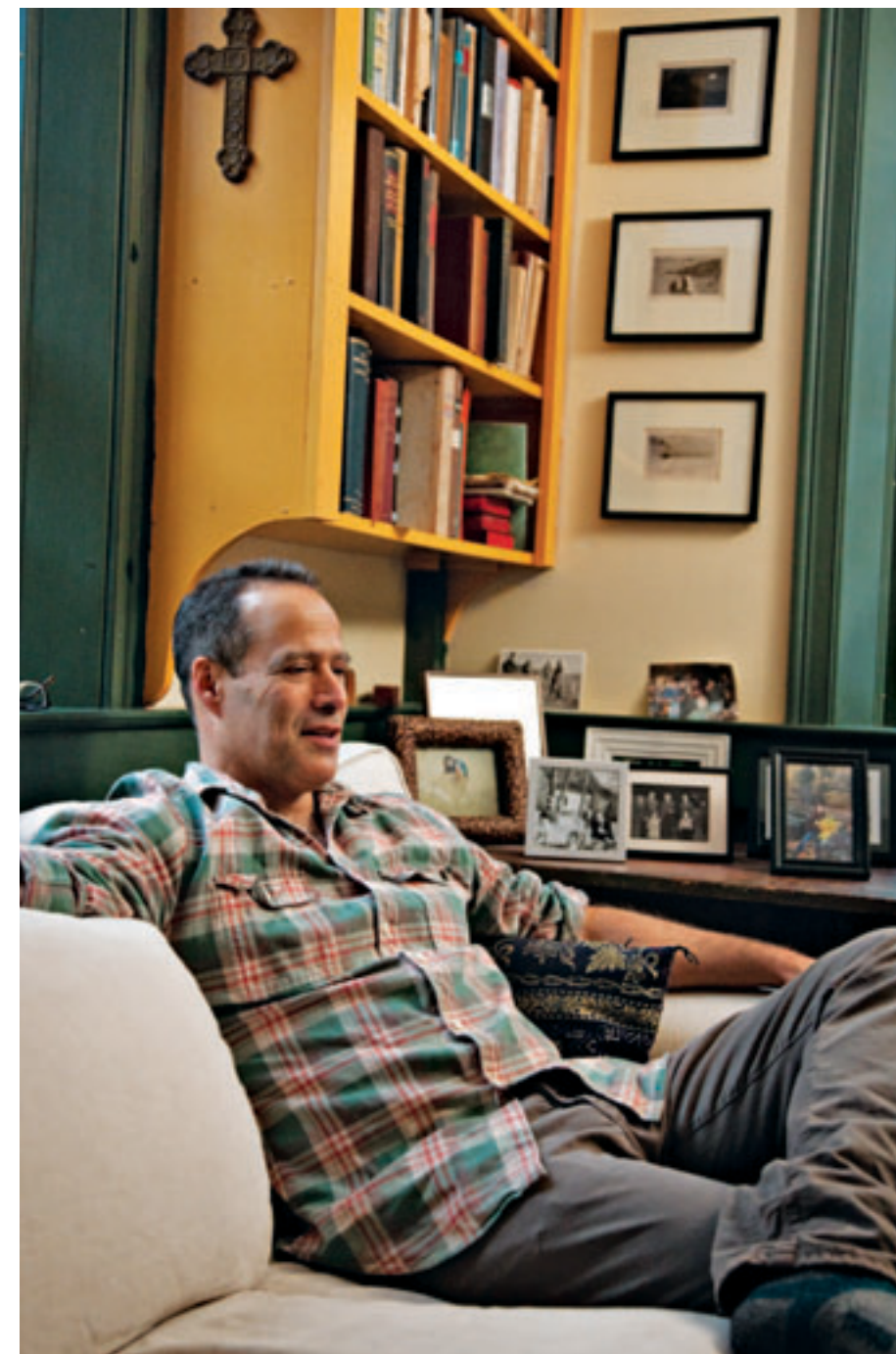
Junger and his wife head back to Truro to relax and write. The author’s family has been coming to the Outer Cape since the 1950s.

When he first headed to Afghanistan, he says “No one expected it to be crazy fighting, because in theory it was a peace keeping mission, and Bush had focused the heavy fighting on Iraq. Even the soldiers thought they’d be sitting on a hill waiting for something to happen.” Junger adds that he too “first went there with the