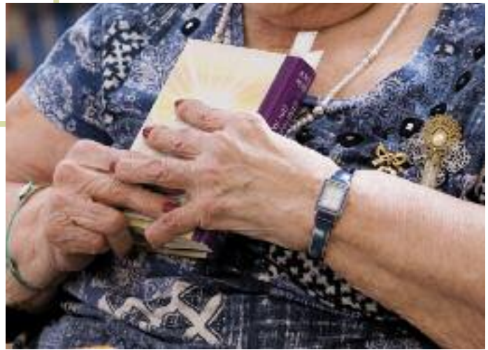
New dining options give residents freedom to eat in their rooms where they can enjoy a book or watch television.