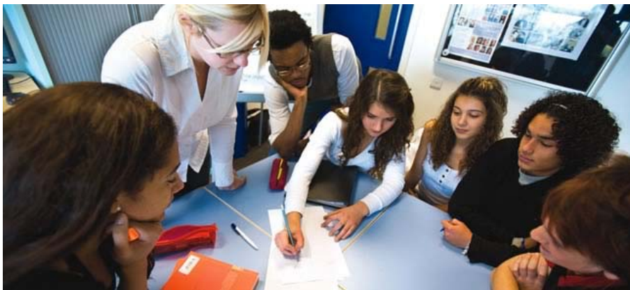
Want personal attention from instructors? Consider a school's student:faculty ratio.