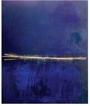
"Linea del Ahora Eterno"/"Line of the Eternal Now". 2014. 24" x 20" Acrylic, modeling paste and diamond dust on canvas.

Email EVENTS@DRYAGER.com by Wednesday, February 22, to secure your admission.