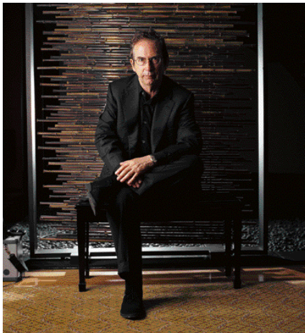
FRANK PETER LIBRARY

For the merely excellent worker, the options between now and October are few. Immigration lawyers and business groups are hard at work, lobbying Congress to raise the cap or remove it altogether, but until US job figures improve substantially, angry displaced voters are likely to hold sway. ●